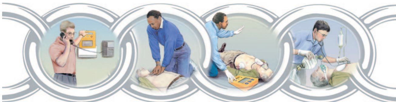
Figure 1. Adult Chain of Survival.

Stroke is the nation's No. 3 killer and a leading cause of severe, long-term disability. 61 Fibrinolytic therapy administered within the first hours of the onset of symptoms limits neurologic injury and improves outcome in selected patients with acute ischemic stroke. 76–78 The window of opportunity is extremely limited, however. Effective therapy requires early