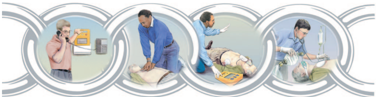
Figure 1. Adult Chain of Survival.

Stroke is the nation's No. 3 killer and a leading cause of severe, long-term disability. 61 Fibrinolytic therapy administered within the first hours of the onset of symptoms limits neurologic injury and improves outcome in selected patients with acute ischemic stroke. 76–78 The window of opportunity is extremely limited, however. Effective therapy requires early